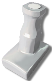
45° LEFT CUT