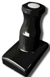
45° RIGHT CUT