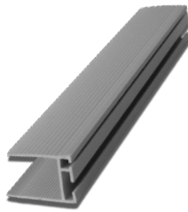
PVC or Aluminum Joint Profile